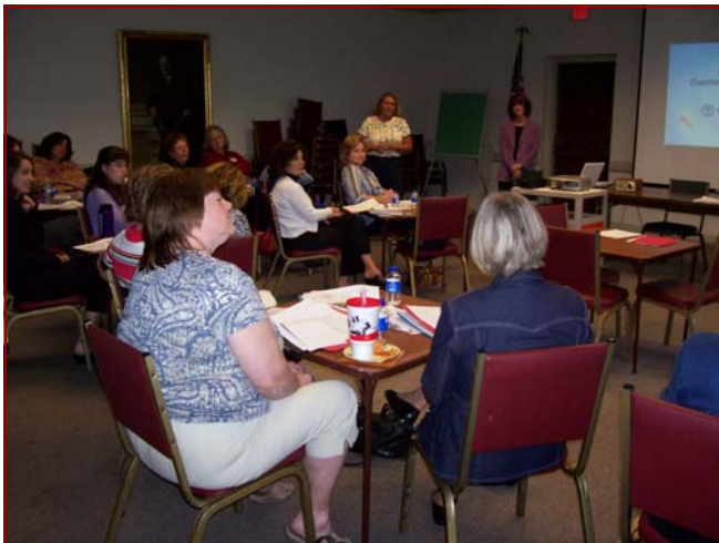
Over 20 library staff from Allegany, Frederick, Garrett, and Washington counties attended the all-day Emergent Literacy workshop, held at the LaVale Branch of the Allegany County Library System.